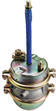
SAP2424L Type 24/24 W/clevis assembly