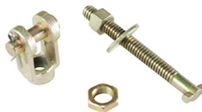
SAP24624L Clevis Assembly w/ PIN