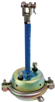
SAP1012L Single Brake Chamber Type 12 w/ Clevis Assembly