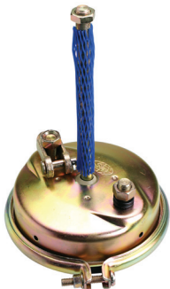
SAP1030L Single Brake Chamber Type 30 w/ Clevis Assembly