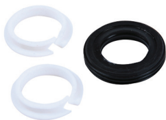
SAP9001L Seal Brake Chamber Type 24, 30