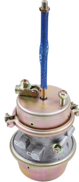
SAP2430L Type 24/30 W/clevis assembly