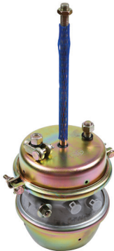
SAP3030LS Type 3030 Permanently Sealed w/ Clevis Assembly