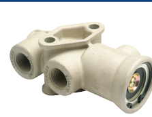
SAP279000 Tractor Protection Valve Model TP-3 Service Tractor Port (1) 3/8" P.T. Service Trailer Port (1) 1/2" P.T. Emergency Tractor Port (1) 1/4" P.T.