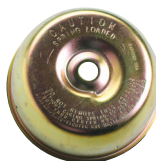
SAP30230L Rear Cover Spring Brake Assembly For 3030L