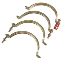
SAP30011L Clamp Assembly Kit For 3030L & 1030L