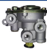
SAP286364 SR-1 Spring Brake Valve Supply Port (1) 1/4" P.T. Delivery Port (1) 1/4" P.T. Reservoir Ports (1) 1/4" P.T. Control Port (1) 1/4" P.T. Reservoir Trip Press.55 PSI