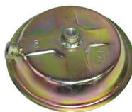
SAP30330L Rear Cover Single Brake Chamber. SAP1030L