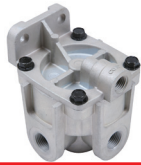
SAP-KN28500 RG-2-Relay Valve Supply Port (2) 3/8" P.T. Delivery Ports (2) 3/8" P.T. Control Port (1) 1/4" P.T. 5.5 PSI Crack Pressure