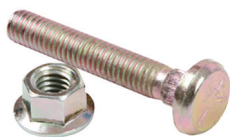
SAP90012L Nut and Bolt for Clamp Assembly