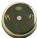
SAP30130L Front Cover Spring Brake Assembly For 3030L & 1030L