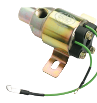
SAP68230 Solenoid Air Valve, 12 Volts