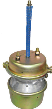
SAP3636L Type 36/36 W/clevis assembly