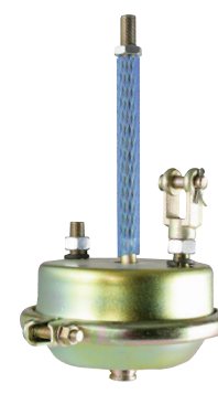
SAP1024L Single Brake Chamber Type 24 w/ Clevis Assembly