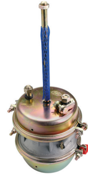
SAP3030L Type 30/30 W/clevis assembly