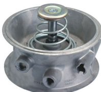
SAP24502L Adapter Housing For 2424L