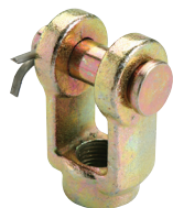
SAP30242L Clevis Assembly w/ Pin For 3030L & 2424L 1030L & 1024L