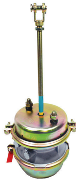
SAP3030LSN Double Brake Chamber