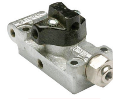
SAP-A4688 Air Control Slave Valve Supply Port (2) 1/8" Delivery Ports (2) 1/8" P.T. Control Port (1) 1/8" P.T.