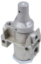
SAP-A4740 Regulator/Filter Ass Non-Adjustable Preset At 57-65 Psi