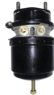
SAP8500L Type 24 for Scania