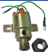
SAP68237 Solenoid Air Valve, 24 Volts