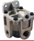
SAP-KN28510 RG-2-Relay Valve. Supply (1) 1/2" P.T. Supply Port (1) 3/8" P.T. Delivery Port (2) 3/8" P.T. Control Port (1) 1/4" P.T. 5.5 PSI Crack Pressure