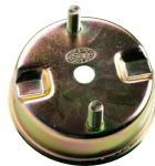
SAP24124L Front Cover Spring Brake Assembly For 2424L & 1024L