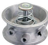
SAP30501L Adapter Housing Assembly For 3030L