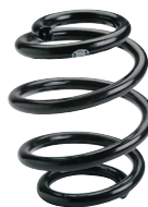
SAP-R24L Air Spring For 2424L