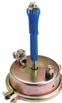
SAP1020L Single Brake Chamber Type 20 w/ Clevis Assembly