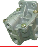
SAP-KN28520 RG-2-Relay Valve Supply Port (2) 1/2" P.T. Delivery Ports (2) 1/2" P.T. Control Port (1) 1/4" P.T. 5.5 PSI Crack Pressure