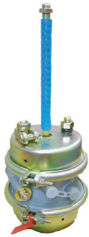
SAP2024L Chamber Type 2024L w/ Clevis Assembly