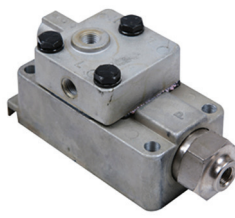
SAP-A5000 Slave Valve Assembly Supply Port (2) 1/8" P.T. Delivery Ports (3) 1/8" P.T. Control Port (1) 1/8" P.T.