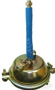
SAP1016L Single Brake Chamber Type 16 w/ Clevis Assembly