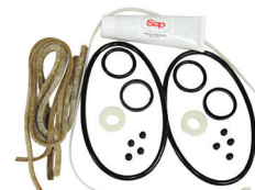
SAP40026 Maxibrake Repair Kit