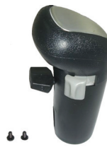
SAP-A6918 Transmission Air Shift Valve All Ports 1/16"